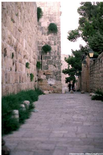
Exploring the Meaning of: Go Through the Gates Part 2

Go through, go through the gates; Prepare the way for the people. Cast up, cast up the highway; gather out the stones; lift up a standard for the people. Isaiah 62: 10